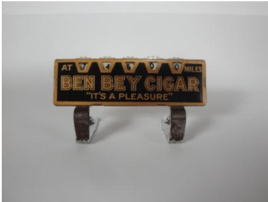
Automobile Mileage Recorder 1930s