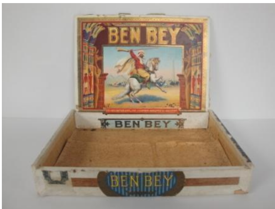
Canadian Ben Bey Cigar Box 1920's