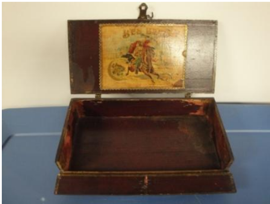
Early Ben Bey Cigar Box 1900-1908

While the cigar tin pictured above and a smaller version are the most iconic representations of the brand, dozens of other wooden and cardboard varieties of Ben Bey cigar boxes exist. The rider on horse is depicted on each inner cover throughout the run.