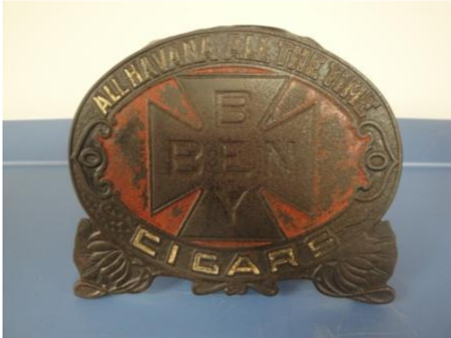
Cigar Clipper 1900-1910s