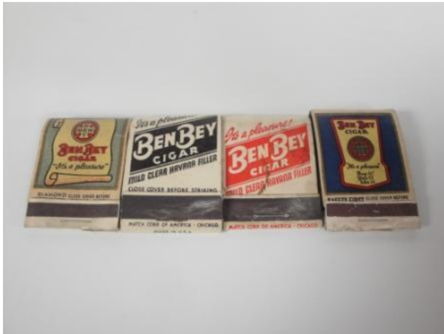
Match Books 1930-1940s

The iconic Ben Bey rider on horse image has mysteriously appeared in venues other than cigar-related items. Sheet music for the "Ben Bey March and Two Step" was published in