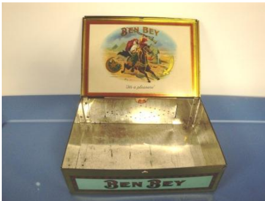
Popular Ben Bey Cigar Tin 1920's