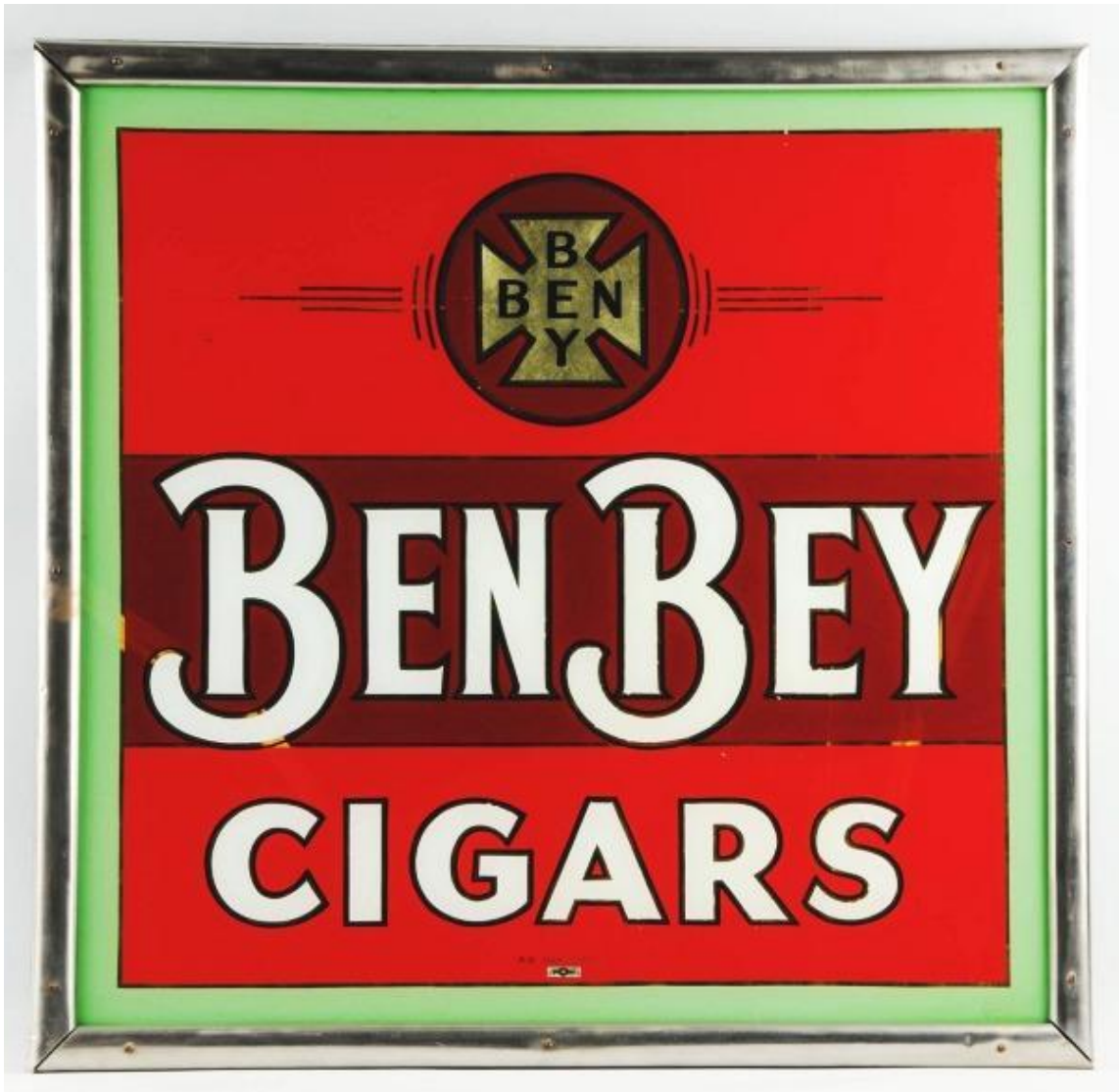
Reverse Painted Glass Sign 36" x 36"