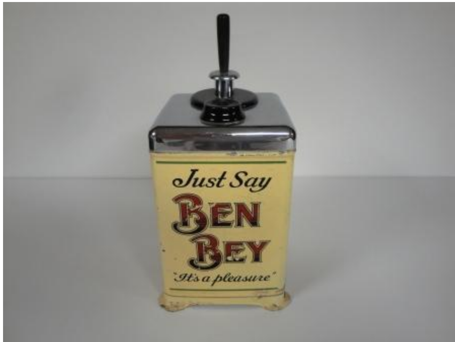
Cigar Lighter 1920's