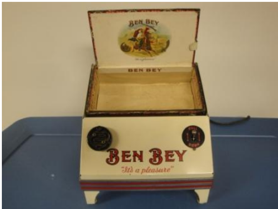
Cigar Lighter and Wooden Cigar Box Display 1930's